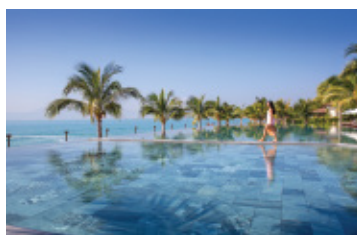
Fresh water pool