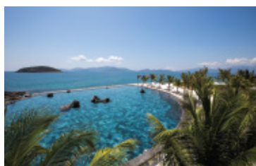
Sea water pool

Refresh yourself in one of our three large swimming pools - sea water pool (2,500m 2 ) and two fresh water pools (700m 2 and lagoon 600m 2 ) or our natural beach lagoon with soft white sand.